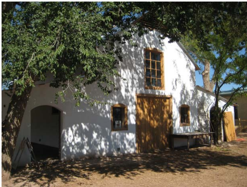
Sena Barn after rehabilitation, house of the new Bernalillo Wine Museum.